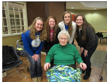
FFA students distributing lap blankets they made for nursing home residents.