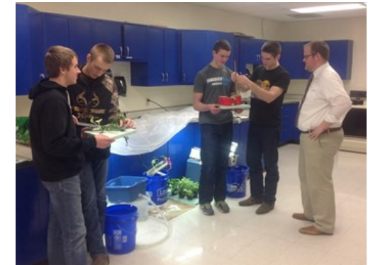
Agronomy students measuring growth on hydroponics systems.