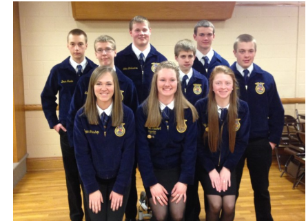
2015-2016 Officer Team

Learning to do Doing to learn Earning to live Living to serve